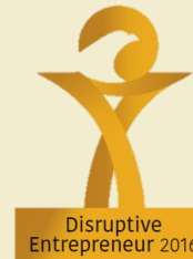
Disruptive Entrepreneur 2016