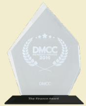
Best Finance Company 2016