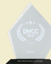
Best Marketing Campaign 2016